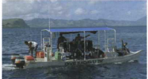
PROPERLY TELLING THE STORY OF YOUR DIVE VACATION MEANS TAKING PHOTOS OF MORE THAN JUST FISH. YOU'LL WANT TO SHOOT DIVE BUDDIES AND PLENTY OF TOPSIDE, TOO.

can be assured that the visual story you are telling has no missing chapters. Best of all, if you don't like a picture, simply press a button and it's gone.